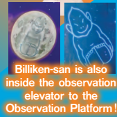
Billiken-san is also inside the observation elevator to the Observation Platform!

At TSUTENKAKU TOWER, you can enjoy magnificent views while visiting the Eight Deities of Good Fortune on the Golden Observation Platform. Here you can also enjoy exhibition, cafés, and shopping while receiving many blessings. Yes, this is the "Naniwa's Power Spot", known by people in the know. Bring along your special someone and boost your good fortune together! UP! UP!